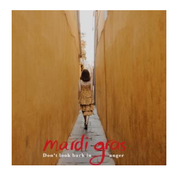
Don't look back in anger (Noel Gallagher) Single independent release – 2020