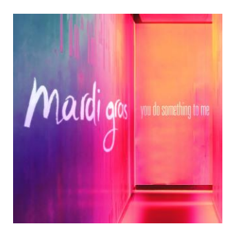
You do something to me (Paul Weller) Single independent release – 2020